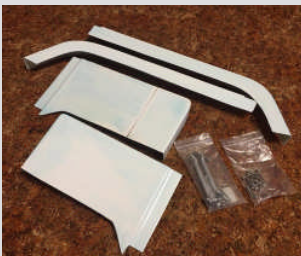
Fibreglass engine bay side panels and engine cover supports $210