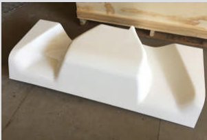
Fibreglass Engine cover $420