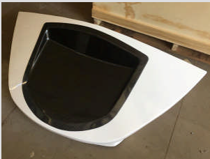
Fibreglass windshield $450