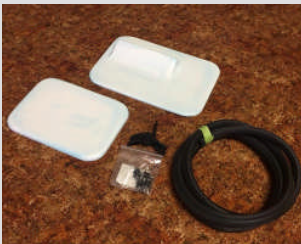
Fibreglass compartments hatches $210